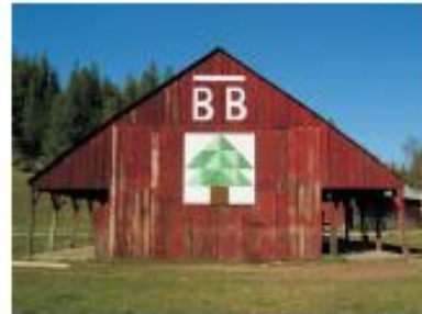
2 BRESCIANI BARN 1845 Quincy Junction Road BQ Pattern: Timber Trees Date of barn construction - circa 1950