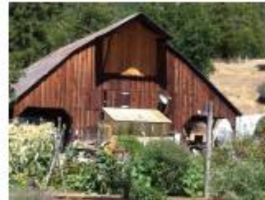
3 GRANT BARN 3094 Chandler Road future site of BQ Pattern: Birds in a Square Date of barn construction - circa 1854