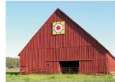
4 BENGARD BARN 4674 Chandler Road BQ Pattern: Harvest Star Date of barn construction - circa 1900