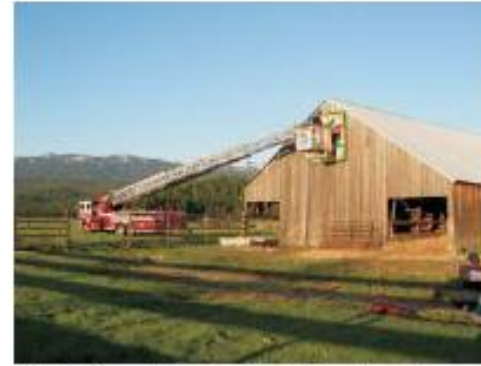
The Quincy Volunteer Fire Department comes through to help mount several barn quilts.