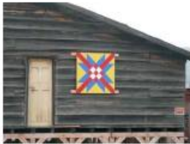
1 WILLIAMS BARN 31 Quincy Junction Road BQ Pattern: Star & Cross Date of barn construction - circa 1917