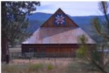
9 THOMPSON VALLEY RANCH BARN 905 La Porte Road BQ Pattern: Americana Star Date of barn construction - 1851 to 1890