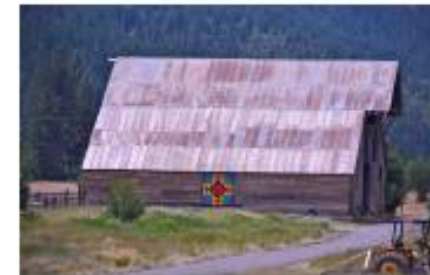
5 DYRR BARN 503 Crescent Street (Hwy 70/89) BQ Pattern: Cups & Saucers Date of barn construction - 1950