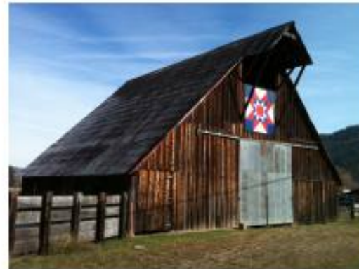
Foster Barn Main St. Taylorsville, CA BQ Pattern: Rising Star

In addition to this driving and biking tour, we encourage you to take a walking tour of downtown Quincy and view the unique and vibrant array of small barn quilts created and displayed by the local businesses.