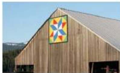
8 CLARKE BARN 2025 Lee Road BQ Pattern: Double Pinwheel Date of barn construction - circa 1968