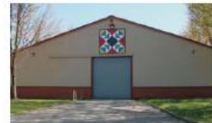
6 SERPILIO HALL Plumas Sierra County Fairgrounds 204 Fairgrounds Road BQ Pattern: Wild Goose Date of barn construction - 1961