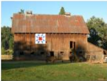
10 FARNWORTH BARN 48228 Hwy. 70 BQ Pattern: North Star Date of barn construction - 1928