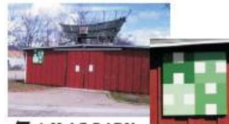
7 4-H AG BARN Plumas Sierra County Fairgrounds 204 Fairgrounds Road BQ Pattern: 4-H Block Date of barn construction - circa 1961