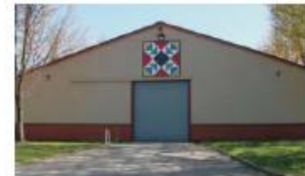
6 SERPILIO HALL Plumas Sierra County Fairgrounds 204 Fairgrounds Road BQ Pattern: Wild Goose Date of barn construction - 1961