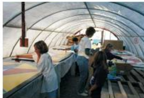
4-H Club Members hard at work painting barn quilts in the greenhouses at the Fairgrounds.