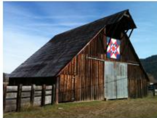
Foster Barn Main St. Taylorsville, CA BQ Pattern: Rising Star

In addition to this driving and biking tour, we encourage you to take a walking tour of downtown Quincy and view the unique and vibrant array of small barn quilts created and displayed by the local businesses.